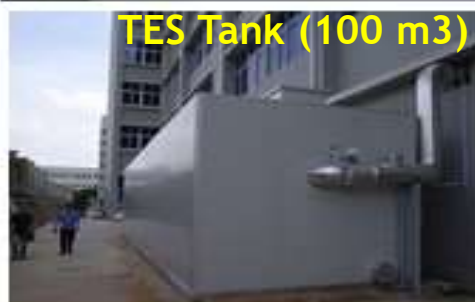
TES Tank (100 m3)